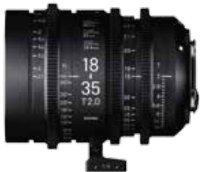
18-35mm T2 Mount:PL, EF, E

T2 brightness throughout the zoom range. Outstanding resolution ready for 6K-8K. These lenses combine top performance with superior compactness.